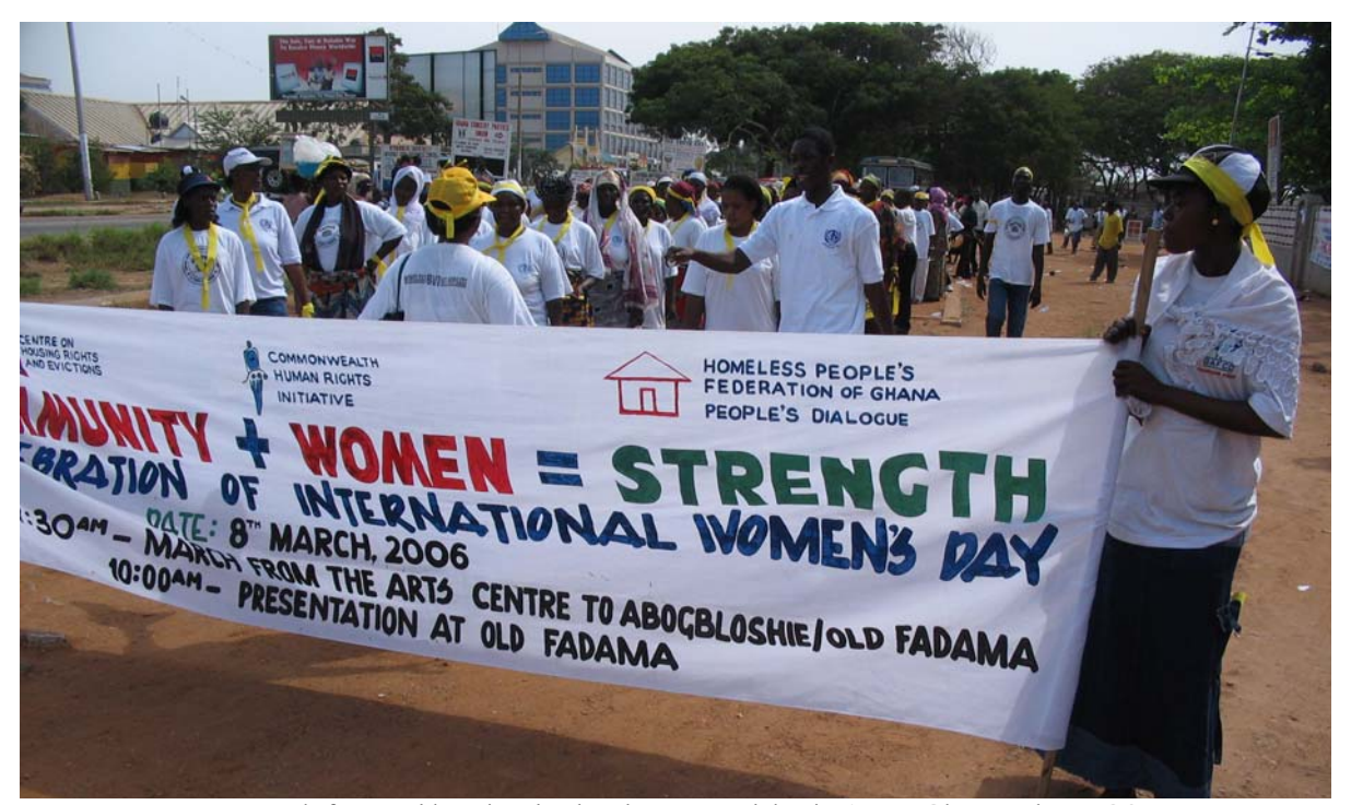
[Women march for equal housing, land and property rights in Accra, Ghana.]

Miloon Kothari UN Special Rapporteur on the Right to Adequate Housing