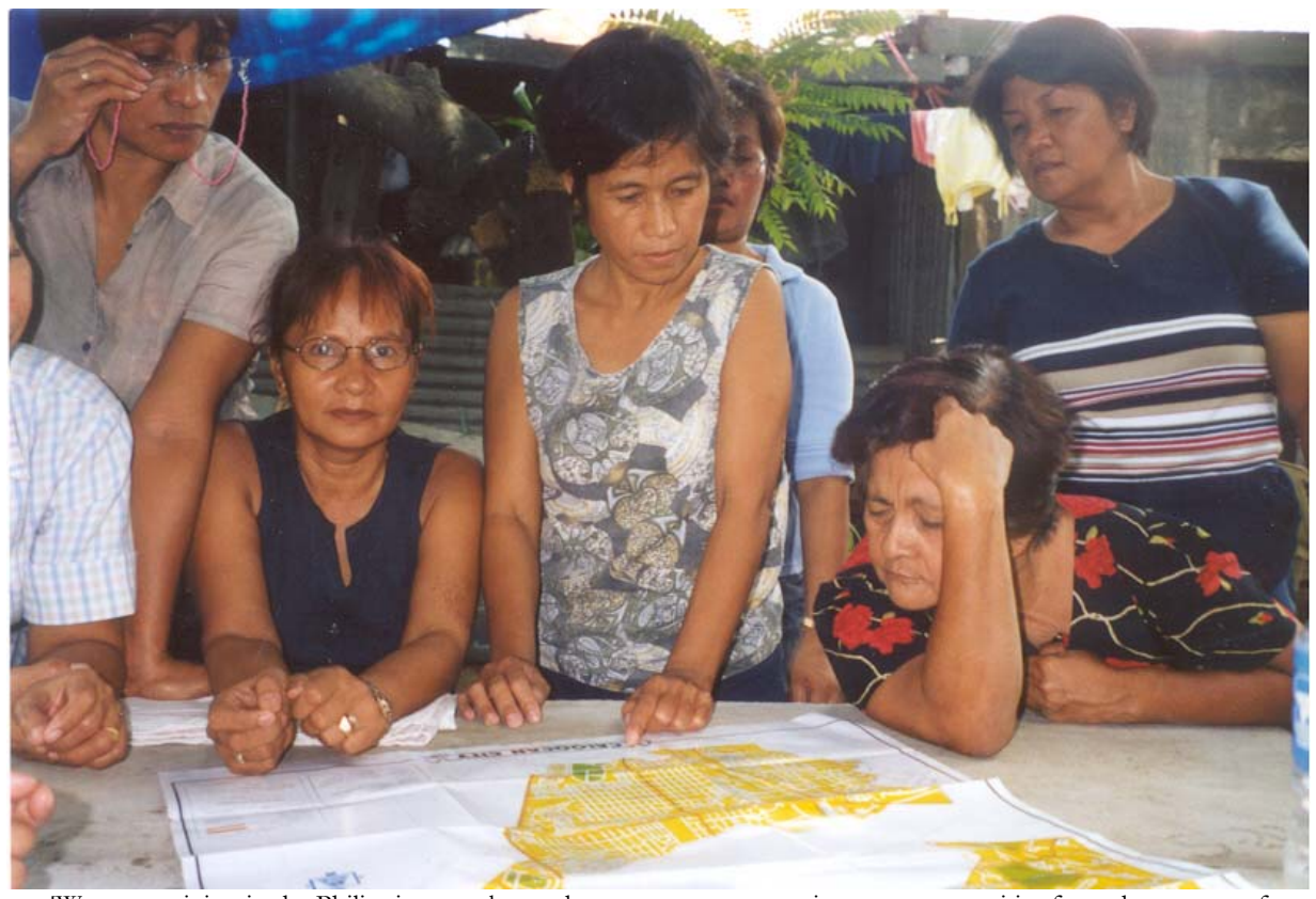
[Women activists in the Philippines work together to protect women in poor communities from the ravages of forced eviction.]

Globally, despite the increased attention given to women's housing rights, it remains essential to develop and enforce norms that actually secure these rights. The good news is that international, regional and national systems now have widespread jurisprudence to secure and promote women's housing, land and property rights. However, gender-based bias grounded on traditional rules and statutory norms that favour men prevent women from enjoying these rights in practice. The various genres of laws ought to inspire each other to generate the most comprehensive housing, land and property rights protections for women everywhere. Though numerous civil society groups are engaged in efforts to clarify new norms and policies for the communities they serve, further work remains to be done.