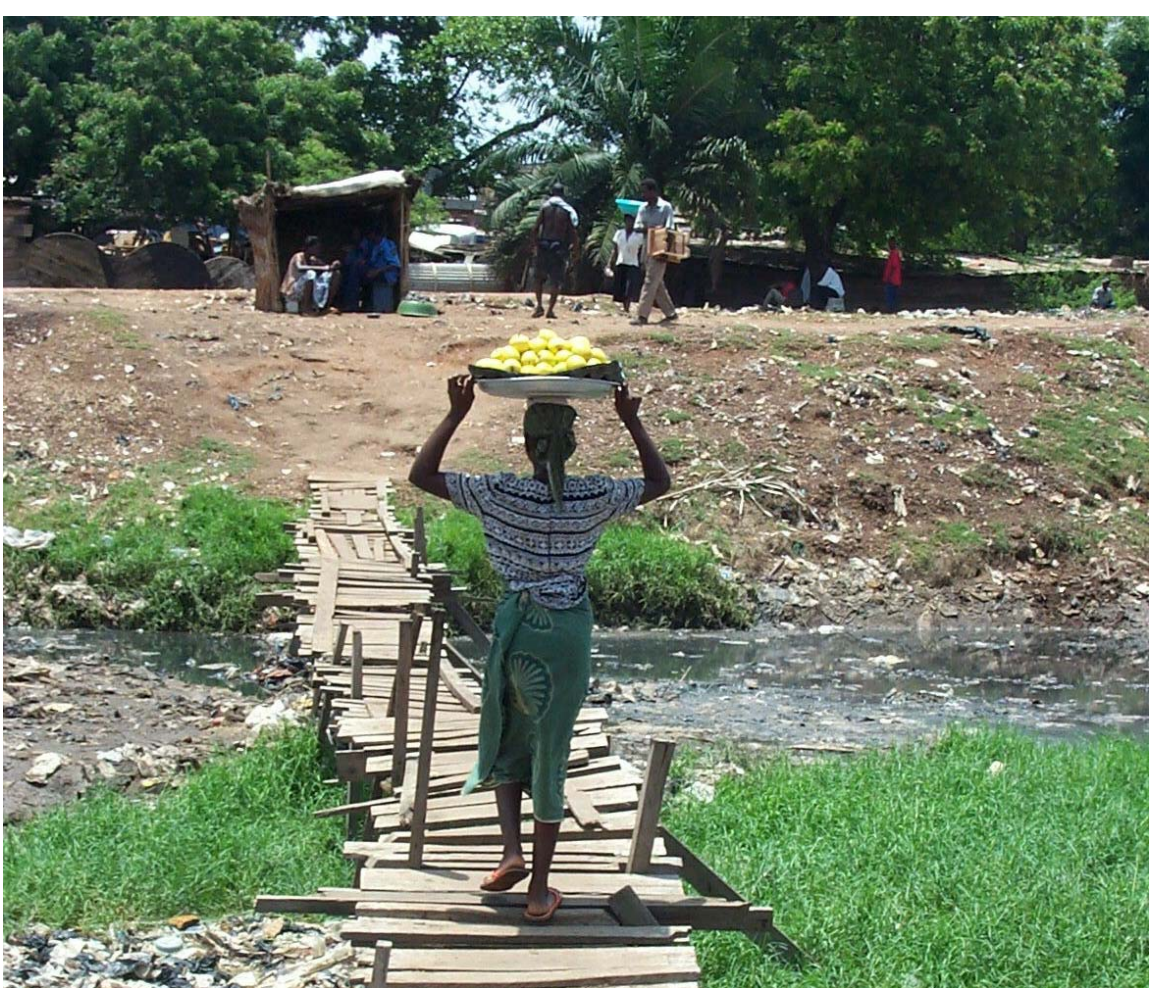
[While the past decade has seen much advancement for women's housing rights, the struggle is far from over. In fact, a careful assessment of where we have been, and where we are now, reveals that several key openings exist for advancing women's housing rights worldwide.]