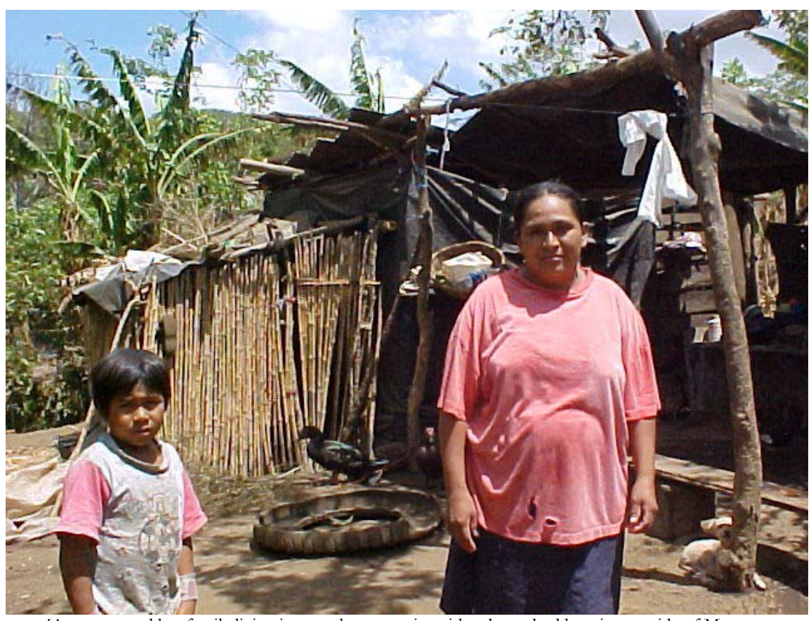
[A woman and her family living in a rural community with substandard housing outside of Managua, Nicaragua. ]

Knowledge generated by research is an essential element of decision-making. Partnerships involving researchers, practitioners and women whose human rights are directly implicated can serve in the development of knowledge, allow for more targeted and effective programs. Research serves as a mechanism for updating information and providing the foundation for decision-making, and can assist in determining appropriate strategies for advocacy.