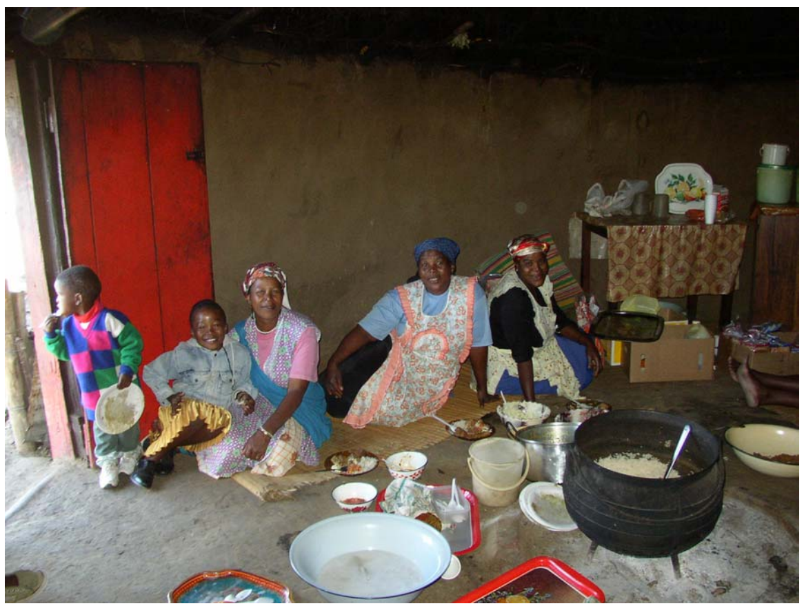
[Adequate housing for women means more than just a roof over one's head. It is a place of income generation, of caring for family, and of protection from insecurity and violence.]

In order to properly appreciate women's housing rights as they have continued to evolve over the past decade, it is important to see how they have been deployed, reconceptualised, and broadened to touch upon issues as critical – and as diverse – as health, freedom from violence, and gender equality. No longer seen to be peripheral issues, women's housing rights are increasingly recognised as central to women's overall well-being and status. In order to illustrate advancements in the field of women's housing rights, this section is organised according to issue, or by theme, so that one can better come to know all of the various spheres in which advocates and activists are raising their voices in loud support of women's housing, land and property rights.