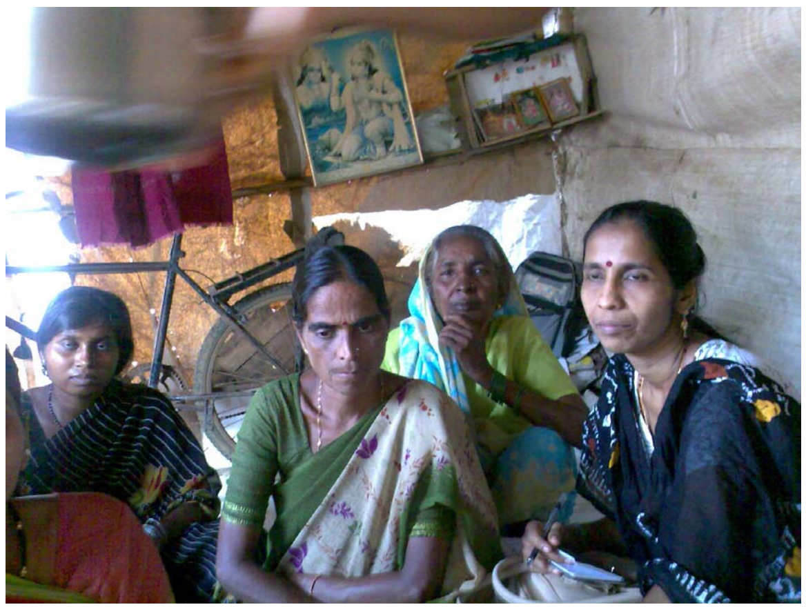
[Women in the slums of Mumbai share with COHRE their experiences of housing insecurity, domestic violence, and threats of forced eviction.]

Over the past decade, women's housing rights have increasingly garnered the attention of the international community. Once seen as being issues merely peripheral to human rights concerns, it has become ever clearer that in order for women to realise the full range of their human rights, housing security is -- indeed -- essential. Without a doubt, advocates all over the world are increasingly recognising that such issues as domestic violence, disinheritance, women's health, women's experience of forced evictions, the impact of the HIV/AIDS pandemic on women and girls, and women's food security, are all fundamentally intimately connected to the theme of women's housing rights. Women's housing rights are also now understood in a more inclusive way, with the understanding that housing security for a woman implies more than just a roof over her head. Rather, adequate housing consists of basic components, such as the right to water and sanitation, which are in fact indispensable to women's daily lives. Perhaps one of the greatest achievements in the field of women's housing rights advocacy is that activists increasingly view housing rights in conjunction with other human rights, inter alia , the right to water and sanitation, the right to health, the right to