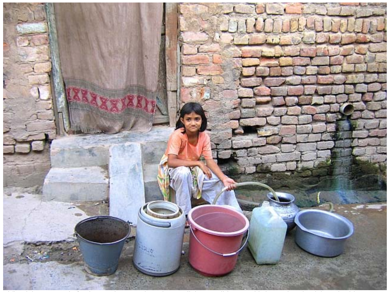
[The right to water is fundamental to ensuring adequate living conditions, and is integral to the right to health. When water is not readily available, women and girls face the added challenge of fetching water, often at great personal costs to themselves.]

The right to water and sanitation is enshrined in international human rights law as a stand alone right.<sup>227</sup> At the same time, water and sanitation are also recognised as integral to the right to adequate housing.<sup>228</sup> In most of the world, gender roles demand that women spend a great deal of time in the home, nurturing children and caring for the needs of their families. Household responsibilities also require women and girls to attend to various household chores, including providing, and using, water for a variety of purposes. For women, the home may also be the principal place of employment or income generating activities, and access to water may be a necessary component of making one's living. Moreover, because women and girls are usually responsible for collecting water for the family's use, regardless