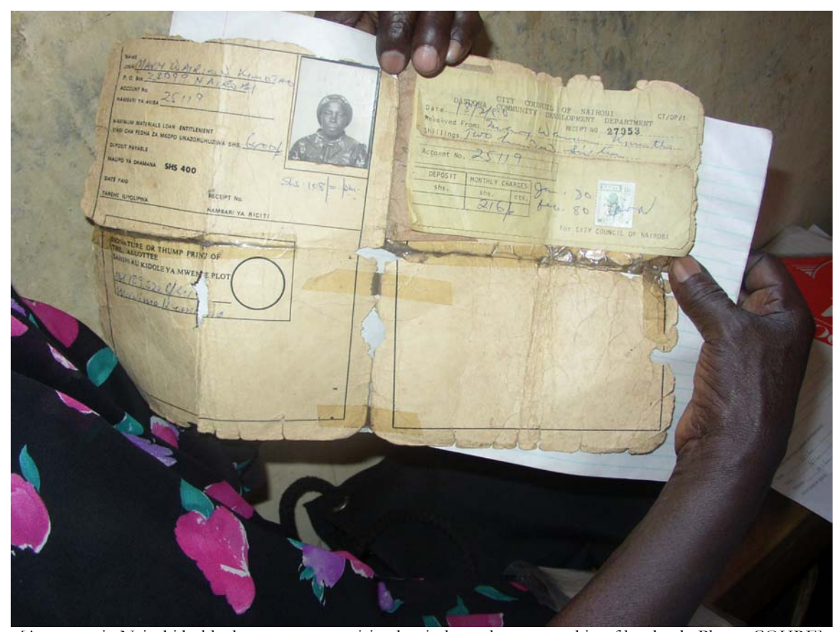
[A woman in Nairobi holds the papers recognising her independent ownership of her land.]

All aspects of women's housing rights touch upon the themes of a woman's rights to non-discrimination and equality. Indeed, the very ideas of non-discrimination and equality are cornerstone human right principles which themselves have enjoyed rich development. International human rights law has repeatedly set forth the overarching right to non-discrimination, a principle which applies to all aspects of housing, land and property. Nevertheless, there is a stark gap between the law and the reality for women. Gender discrimination in relation to housing security continues to characterise the daily reality of women in all corners of the world.